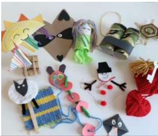
Just SOME of the kits completed this past YEAR!

The recital will begin at 6:30 p.m. on February 7th (to be rescheduled for inclement weather). As always, there is no charge and all are welcome. Come out and enjoy a lively tour through two centuries of piano music.