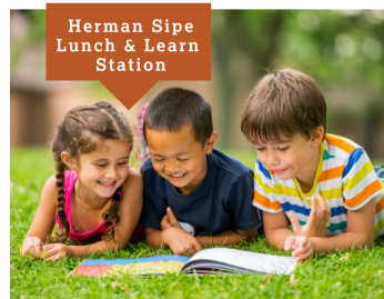
Herman Sipe Lunch & Learn Station

Power up your brain and your body this summer!