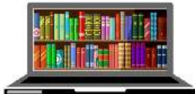
Friends of the Sherrills Ford - Terrell Library