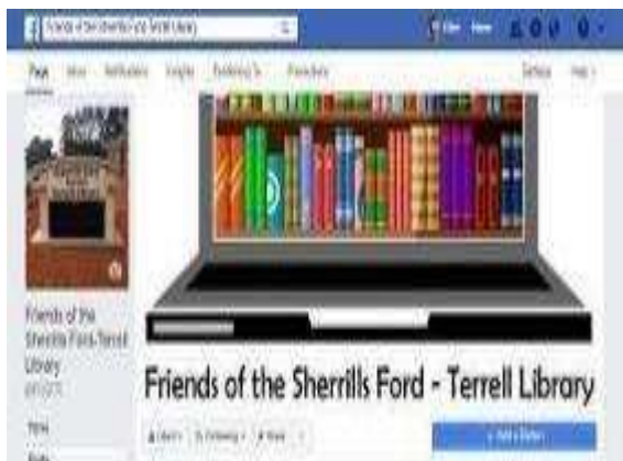
A screen shot of the home page.