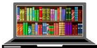
Friends of the Sherrills Ford - Terrell Library