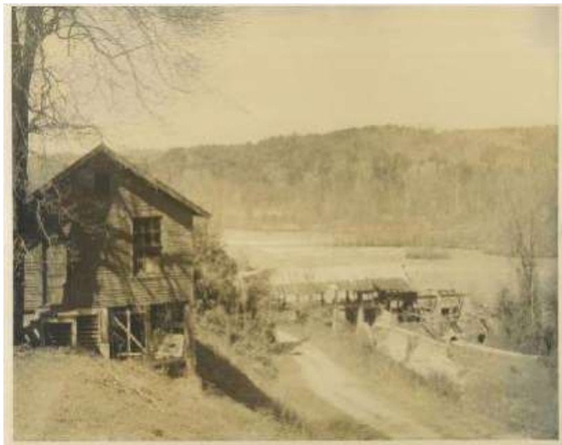
View of the dam on the Catawba River at Long Island that supplied power to the Long Island Cotton Mill. The dam and the mill were swept away in the 1916 flood (caused by two simultaneous Cat. 4 hurricanes).