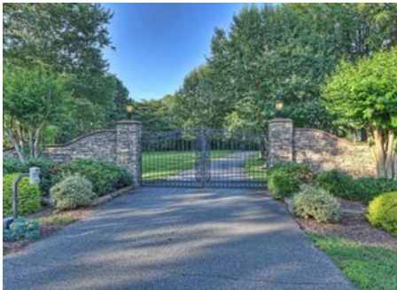
Exit Only Gate Concept