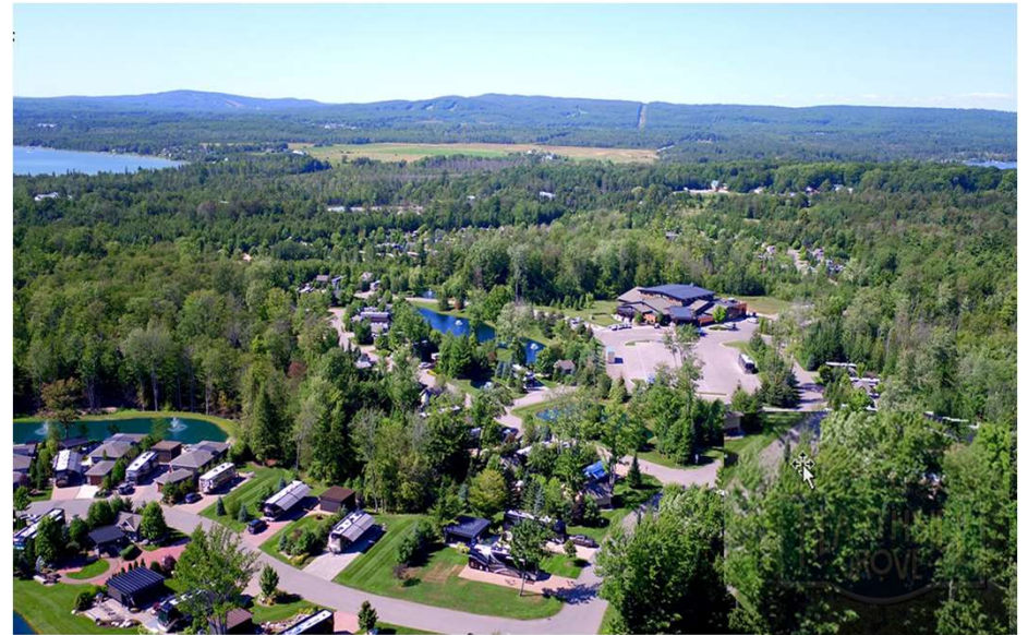
Hearthsides Grove, Michigan (Similar Concept – Nationally Ranked Luxury RV Resort)

Lakecations Resort will provide guests with a variety of outdoor hospitality accommodations including the use of Tiny Homes, Tree Houses, Yurts, Cabins, and traditional RV spots. The resort will be supported by a wide variety of amenities and activities including an Aerial Adventure Park, Climbing Tower, Natural Amphitheater, Swimming pools, Recreation Center, Great Lodge, hiking/biking trails, and direct Lake Norman access for boating, fishing, kayaks, etc.