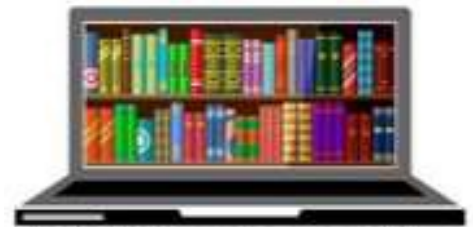
Friends of the Sherrills Ford - Terrell Library