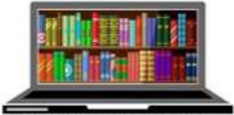
Friends of the Sherrills Ford - Terrell Library

Search for Friends of Sherrills Ford-Terrell Library on Facebook