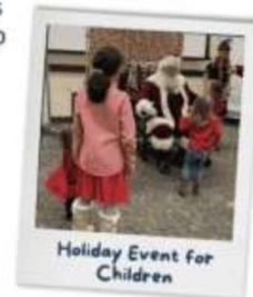
Holiday Event for Children