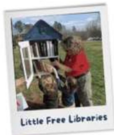
Little Free Libraries

Your donation above the $10 annual Family Membership makes a big impact – it helps fund 75% of our programs. While membership dues cover a portion of our budget, we rely on generous donations to keep offering vibrant literacy and lifelong learning programs for the Sherrills Ford-Terrell community.