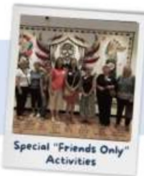
Special "Friends Only" Activities

Friends of the Library is a 503(c) (3) non-profit, charitable organization dedicated to supporting our local library and community. Through our efforts, we provide programs that promote literacy, foster lifelong learning, and strengthen our community ties.