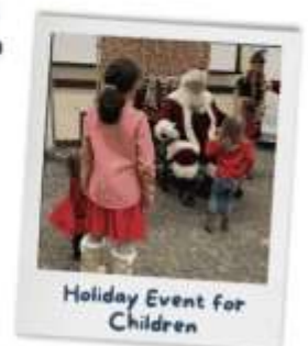
Holiday Event for Children