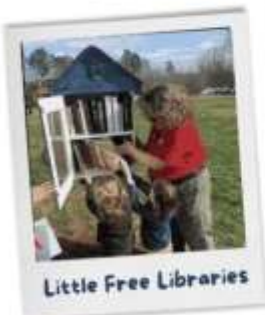
Little Free Libraries

Your donation above the $10 annual Family Membership makes a big impact – it helps fund 75% of our programs. While membership dues cover a portion of our budget, we rely on generous donations to keep offering vibrant literacy and lifelong learning programs for the Sherrills Ford-Terrell community.