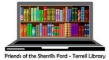
Friends of the Sherrills Ford - Terrell Library