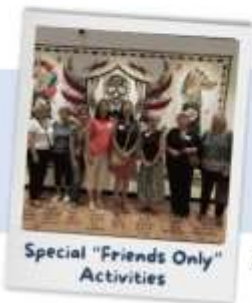
Special "Friends Only" Activities

Friends of the Library is a 503(c) (3) non-profit, charitable organization dedicated to supporting our local library and community. Through our efforts, we provide programs that promote literacy, foster lifelong learning, and strengthen our community ties.