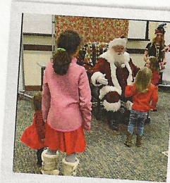
Holiday Event for Children