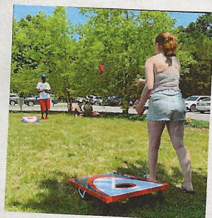
Family Fun Days