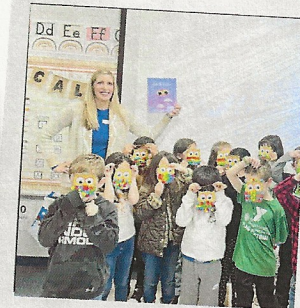
1st and 2nd Grade Literacy Programs

Friends of the Library is a 503(c) (3) non-profit, charitable organization dedicated to supporting our local library and community. Through our efforts, we provide programs that promote literacy, foster lifelong learning, and strengthen our community ties.