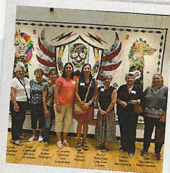
Special "Friends Only" Activities

Friends of the Library is a 503(c) (3) non-profit, charitable organization dedicated to supporting our local library and community. Through our efforts, we provide programs that promote literacy, foster lifelong learning, and strengthen our community ties.