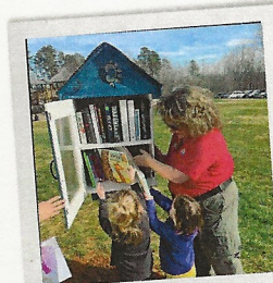
Little Free Libraries