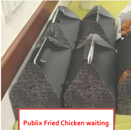
Publix Fried Chicken waiting to be enjoyed.