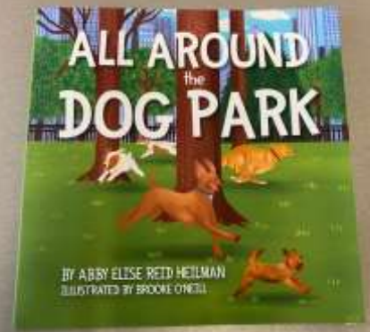
Everyone looked through to see if their dog was pictured!