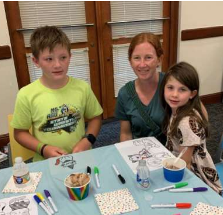
Coloring and Tasting