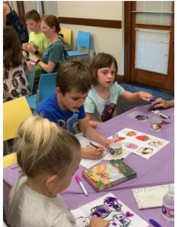
Drawing and Sticking