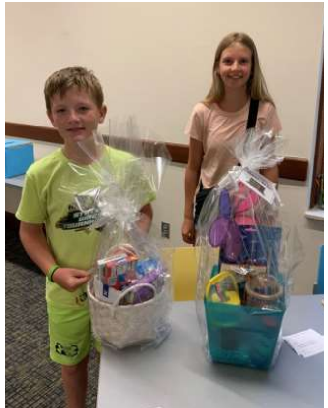
Baskets & Kids, Both Beautiful