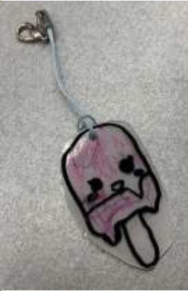
Shrinky Dinks on Demand