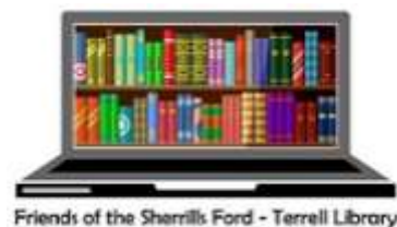
Friends of the Sherrills Ford - Terrell Library